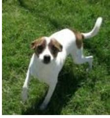
Dogs Can Get MJ Skin Disorder, Vitiligo

Michael Jackson's Skin Condition That Causes Loss of Color