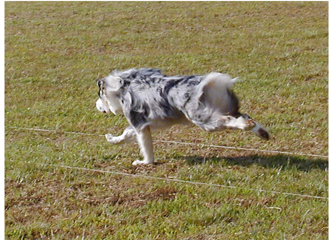
Figure 2. In this galloping dog, the dewclaw is in touch with the ground.

--from Miller's Guide to the Dissection of the Dog