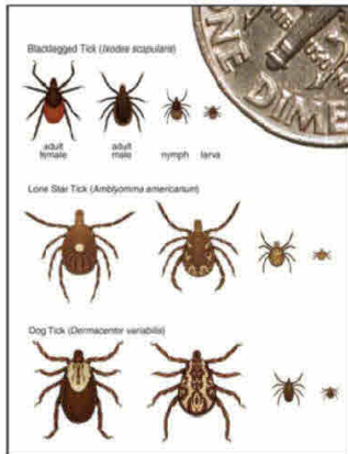
Images of the most common ticks in the United States

The most common ticks in the United States are the black legged ticks (which can carry the organisms known to cause Lyme disease, anaplasmosis, babesiosis, and Powassan disease), Lone Star ticks (which can carry the organisms that cause ehrlichiosis, tularemia and the Southern Tick-Associated Rash Illness (STARI)), and American dog ticks (which can carry the organisms which cause Rocky Mountain spotted fever and tularemia).