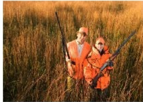
image of Hunters

Ticks can transmit serious and potentially fatal diseases like Lyme disease, ehrlichiosis and tularemia. Many of these illnesses can be treated effectively when caught early, so see your doctor right away if you have a fever, rash or flu-like symptoms after being in tick-infested areas. Frequent tick checks increase the likelihood of finding a tick before it can transmit disease.